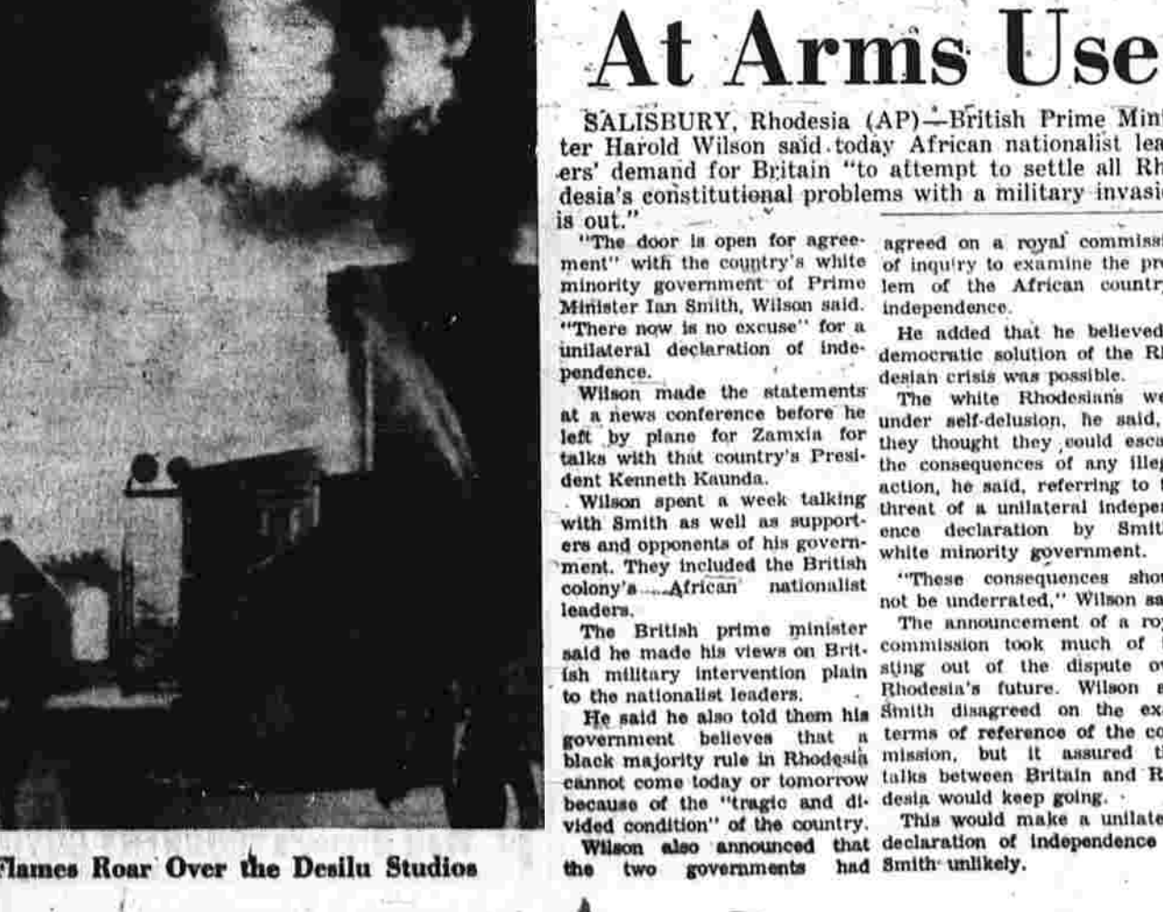
Flames Roar Over the Desilu Studios

In Rhodesia Wilson Balks At Arms Use SALISBURY, Rhodesia (AP) — British Prime Minister Harold Wilson balked today African nationalist leaders' demand for Britain "to attempt to settle all Rhodesia's constitutional problems with a military invasion is out." The door is open for agreement on a royal commission with the country's white minority government of Prime Minister Ian Smith, Wilson said. "There now is no excuse" for a unilateral declaration of independence, he said. He added that he believed a democratic solution of the Rhodesian crisis was possible. The white Rhodesians were under self-determination, he said, if they thought they could escape the consequences of any illegal action, he said, referring to the threat of a unilateral independence declaration by Smith's white minority government. "These consequences should not be undertaken," Wilson said. The announcement of a royal commission would mark the end of the dispute over Rhodesia's future, Wilson said. He also told them his government believes that a terms of reference of the commission would be set up in Rhodesia, but it assured that it cannot come today or tomorrow because of the "tragic and divided condition" of the country. This was a unilateral declaration of independence by Wilson also announced that the two governments had Smith-unlikely.